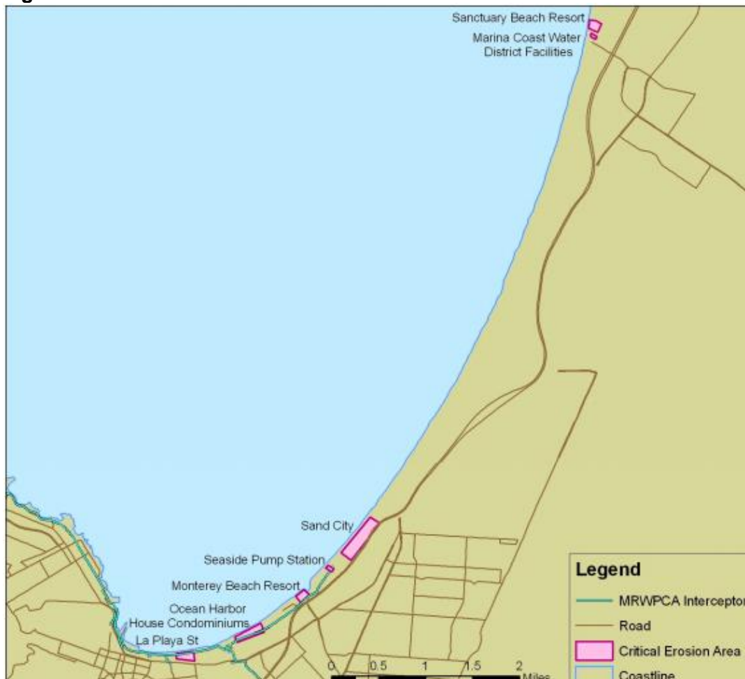
Figure 3: Locations of critical areas of erosion