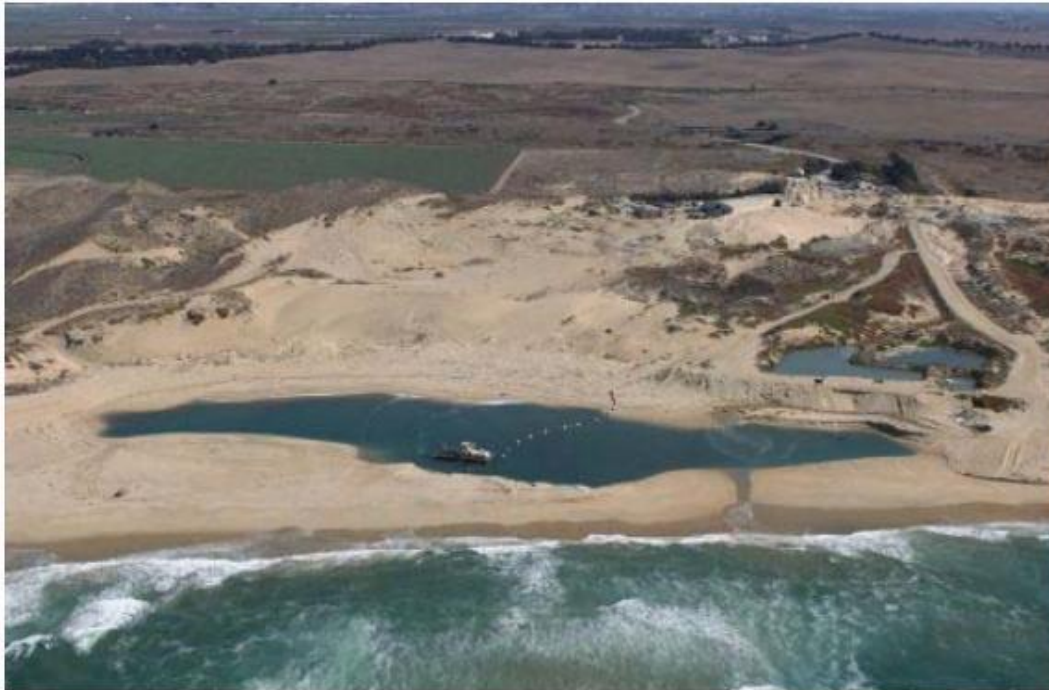
Figure 2: The Lapis mine site and dredge pond. Note how waves from the bay (foreground) wash over the beach (right side of photo), depositing water and sand into the Lapis mine pond.

Since shoreline dredging at Lapis ceased in 1959, the mine has been using a suction dredging process to extract sand from a man-made pond located between the shoreline and dunes (Hart, 1966) (See Figure 2). This mining process acts as a sand sink, drawing in sand during annual storm events and high tides. This results in less sand available in the southern Monterey Bay littoral cell sand budget 1 and significantly impacts the erosion rate (PWA, 2008). The southern Monterey Bay littoral cell is bound by the Salinas River to the north and Municipal Wharf II in Monterey to the south and comprises the geographical scope of this study. Waves refracting over the submarine canyon offshore from the Salinas River delta cause the mean alongshore sediment transport south of the Salinas River to be directed South, and the mean alongshore sediment transport north of the Salinas River to be directed North (Thornton et al, 2006).